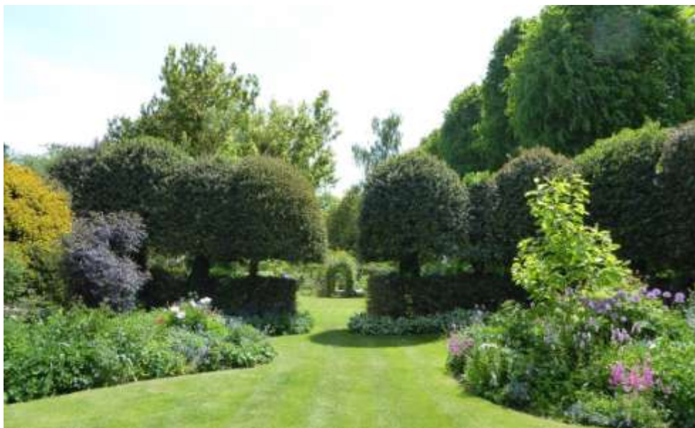
The Thatched Cottage Garden, Farrington. (See Cardiac Rehab Article)

Facebook: https://www.facebook.com/steepfroxfordandprivettchurches