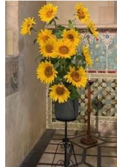
High Summer in High Cross

(Wonderful Sunflower pedestal arrangement by Teresa Brown)